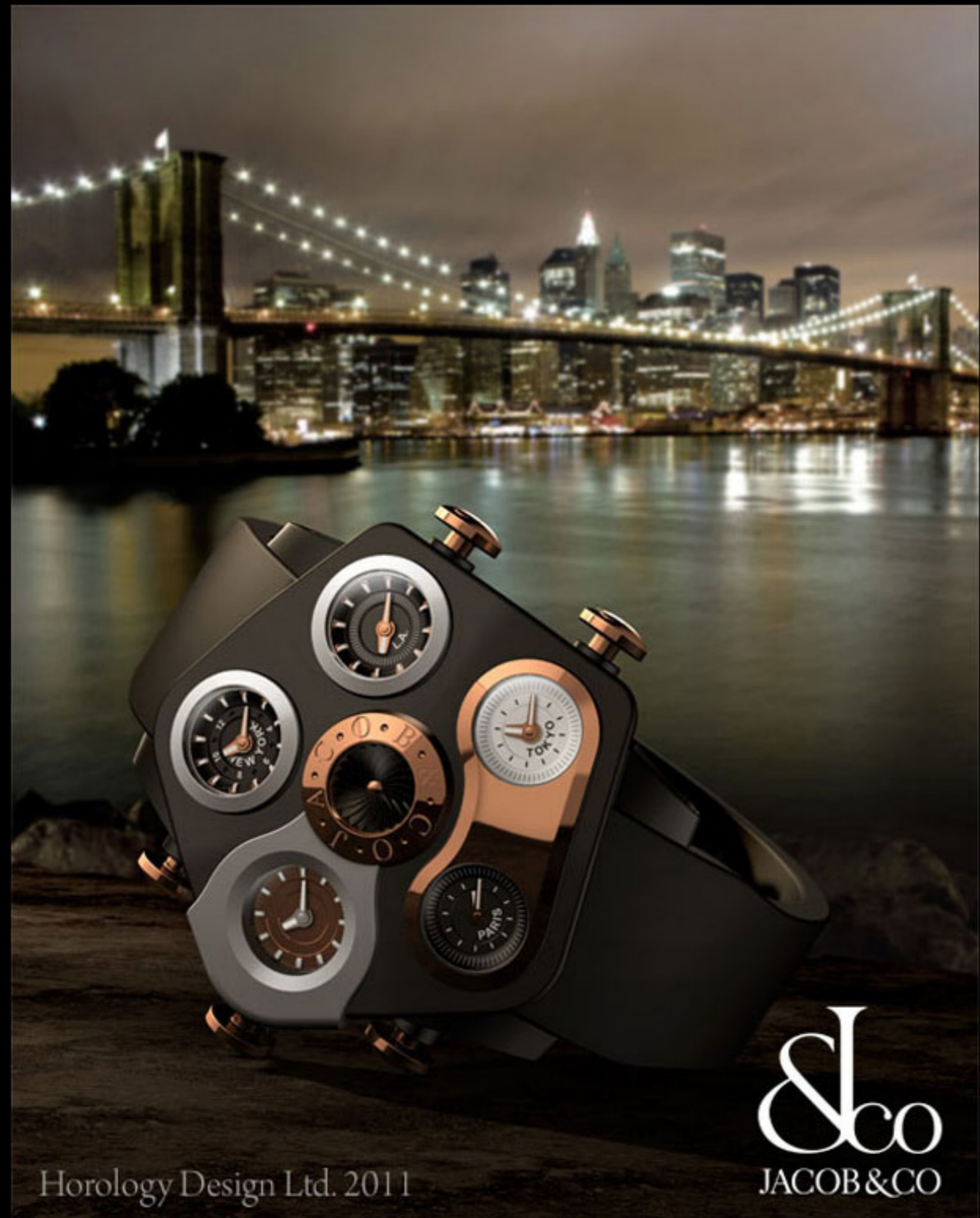
Horology Design Ltd. 2011

"I like England for the people and what they have achieved. Being located in UK is a clear advantage for me. I can work for brands worldwide without being influenced by the industry outside of my contacts. I like to say a good designer should create his own trend, my motto is to produce innovative and distinctive products which look like no other ones".