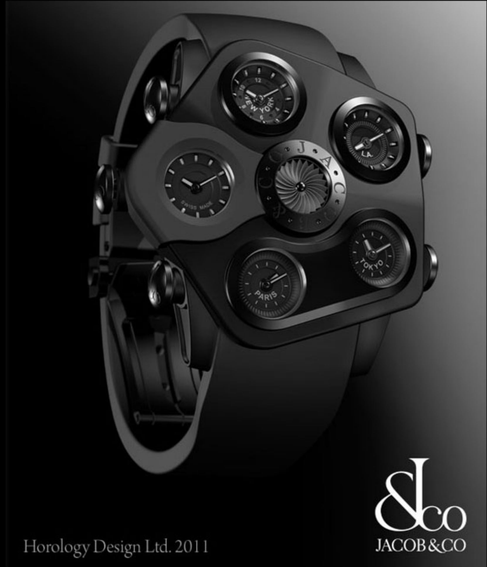
Horology Design Ltd. 2011