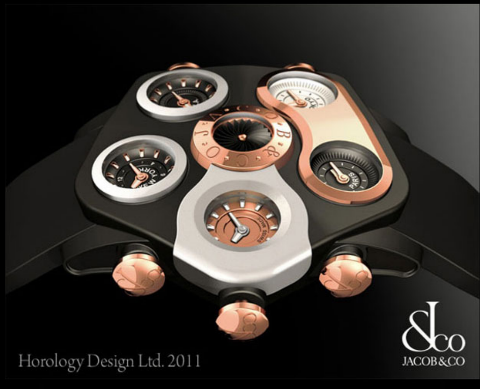
Horology Design Ltd. 2011