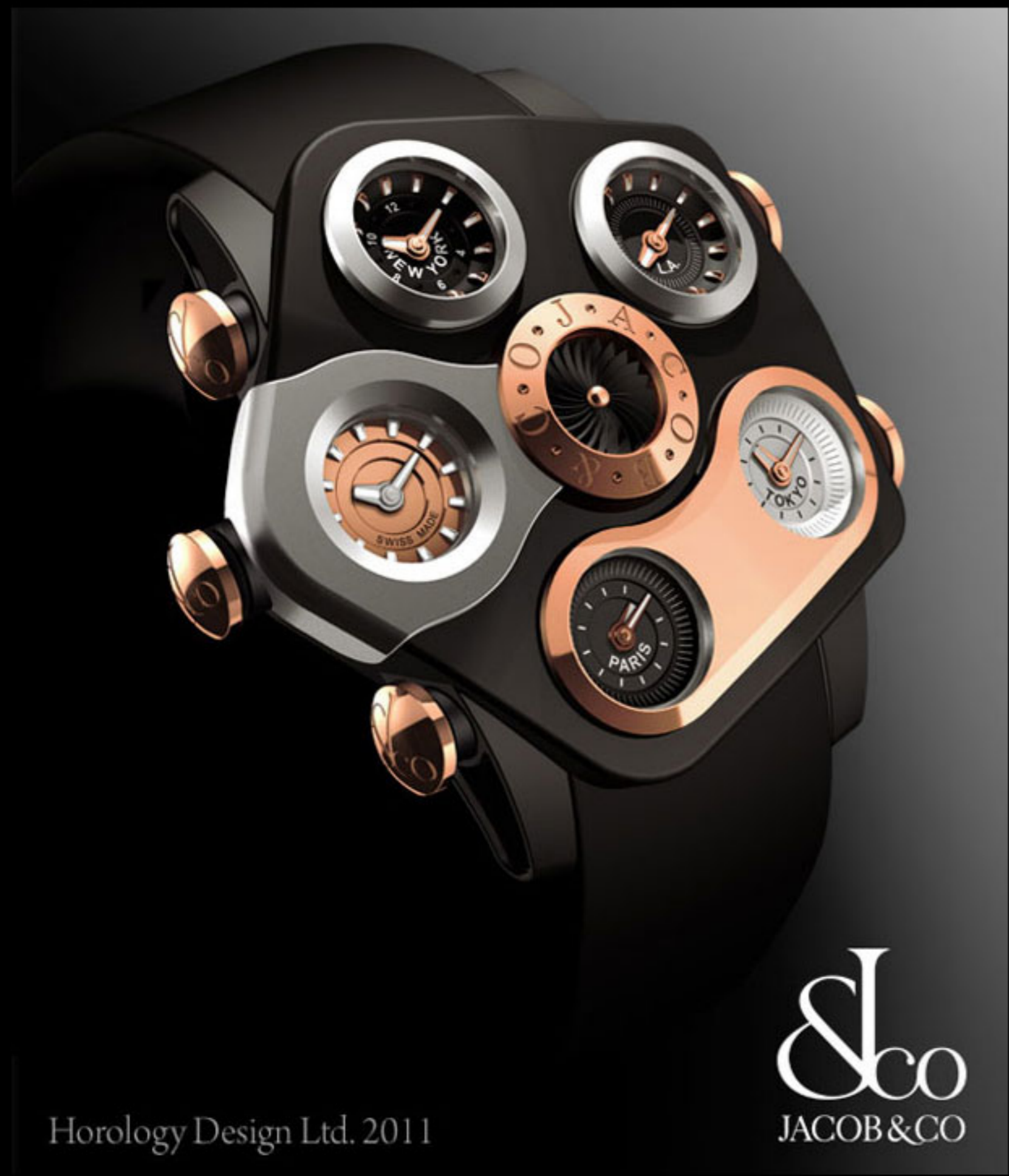
Horology Design Ltd. 2011